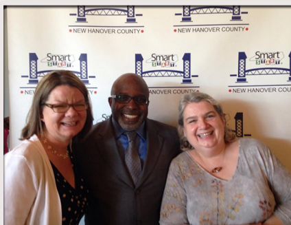
First 2000 Days Summit 2017