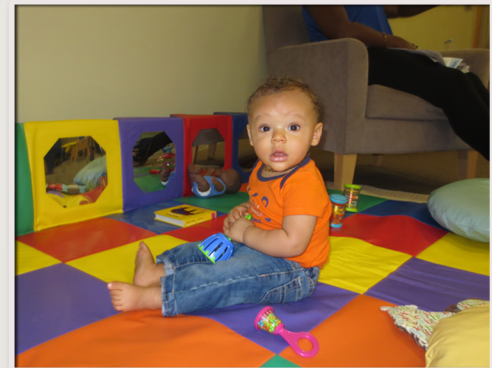
TODDLER PLAYING IN THE SSNHC RESOURCE ROOM

The Smart Start Behavior and Inclusion Support staff have been so helpful in providing strategies to reduce several challenging behaviors in my classroom, including the use of a visual schedule and transition cards.