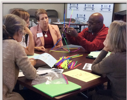
2016 Board Retreat