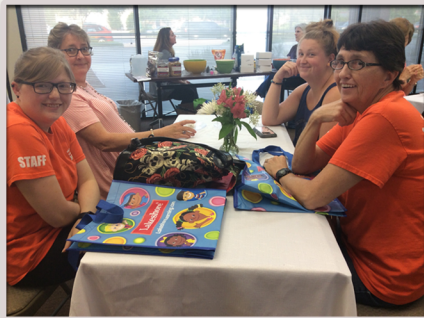
Provider Appreciation Day 2017