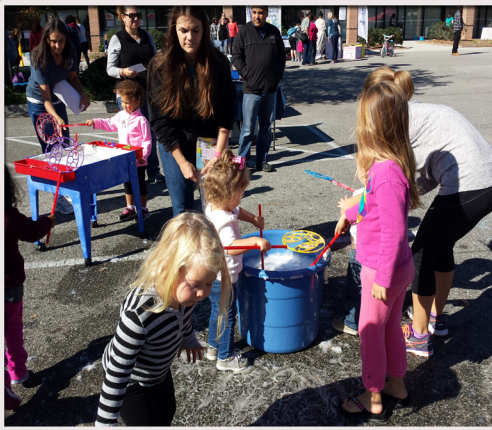
Children learning through play at Family Festival 2016

Our 2nd Annual Family Festival was a great success, with increased attendance numbers and sponsorships which enabled us to purchase more materials to give to parents. Notably, we distributed laminated “vroom” activity cards in the reusable bags donated by Lakeshore to each family that checked in at the check-in table.