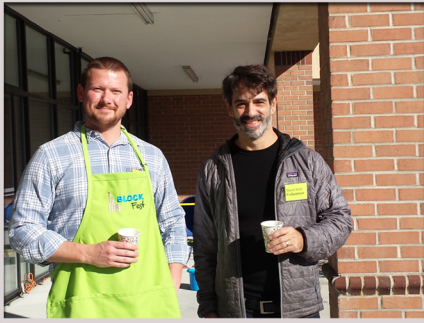
Family Festival 2016