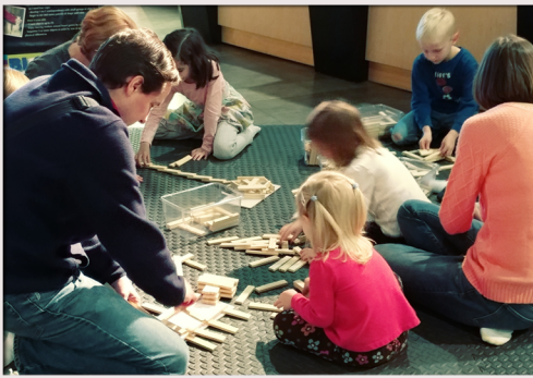
Parents and children at Blockfest

Families participating in Parents As Teachers have been connected to many community resources including the WAVE Transit for bus passes, The Diaper Bank of the Lower Cape Fear, ESL Classes, Children's Developmental Services Agency (CDSA) for additional early intervention services, and community enrichment organizations such as the New Hanover County Library and Fit for Fun.